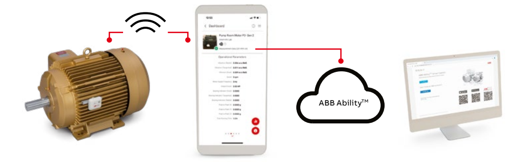
ABB Ability<sup>™</sup> Smart Sensors include access to the ABB Ability<sup>™</sup> digital platform. This portal allows you to monitor asset function and analyze data trends, leading to better uptime and ensuring that critical operations run smoothly and consistently.

The sensor uses Bluetooth Low Energy to wirelessly communicate information about the assets operational health via your smartphone or Bluetooth-gateway to a secure server. Data from the sensor can be displayed graphically on a smart phone, tablet or the ABB Ability<sup>™</sup> web portal.