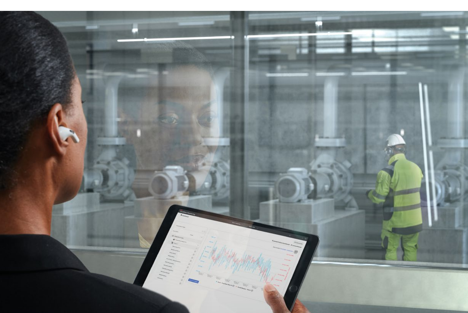
ABB Ability<sup>™</sup> Smart Sensor Condition monitoring for powertrain