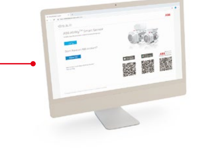
ABB Ability<sup>™</sup> can combine data collected by the sensor with data from other connected equipment, such as variable-speed drives and pumps. This data can be accessed and analyzed remotely, providing deeper insight into the health of the entire process.