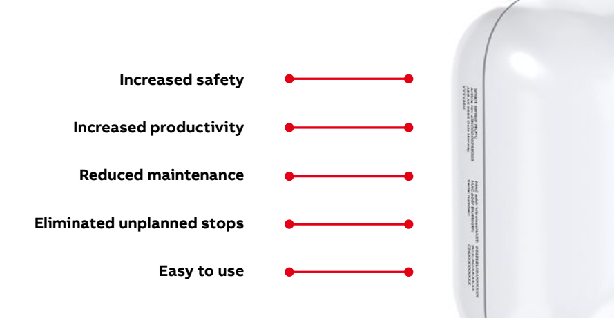
ABB Ability<sup>™</sup> connects you to the power of industrial IoT. ABB offers a unique digital advantage by combining connectivity and data analytics with our expertise to make your operations efficient, predictable and safe.

The ABB Ability<sup>™</sup> Smart Sensor converts rotating equipment, such as motors and general machinery, into smart, wirelessly connected assets. It enables users to monitor the health of their equipment and to plan maintenance in advance. Unplanned downtime can be avoided, efficiency optimized and safety improved.